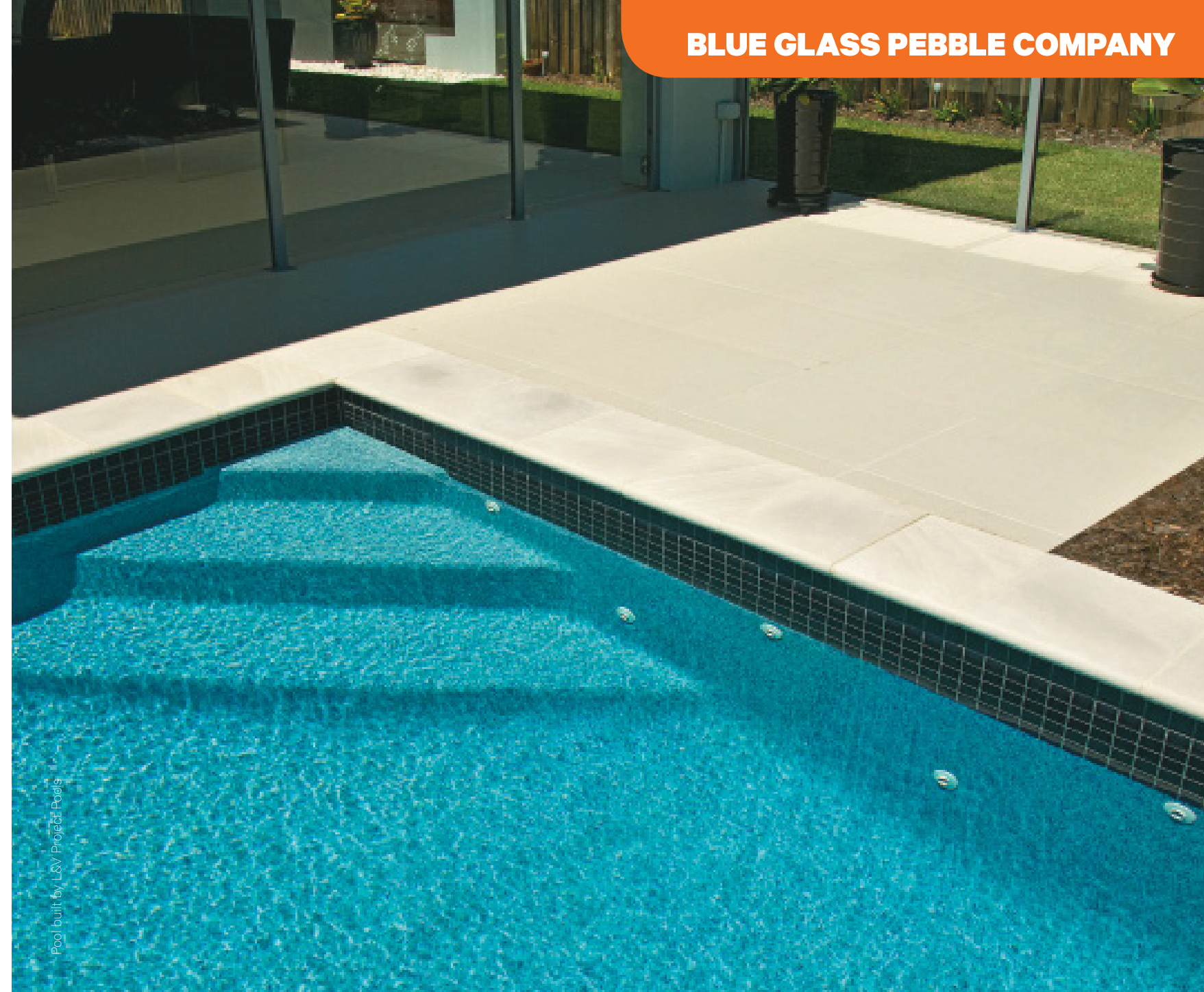
Pool built by L&V Project Pools

B lue Glass Pebble Company is one of Australia's premier suppliers of glass pebble finishes for concrete pools. The company believes its products offer customers the most stunning finish, the best value for money and the most durable and user-friendly finish on the market. Blue Glass Pebble Company backs its product so much that it offers an industry-leading 10-year warranty on its range of spectacular glass pebble finishes.